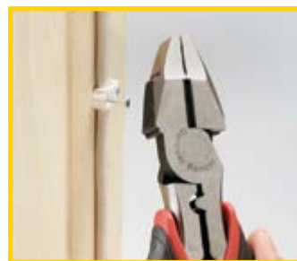
GPT-90 – Hammer Head