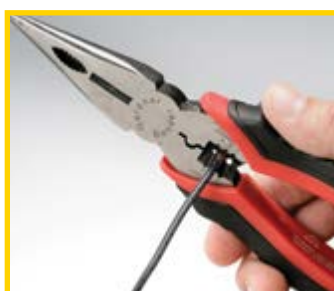
GPT-80 – Wire Stripping